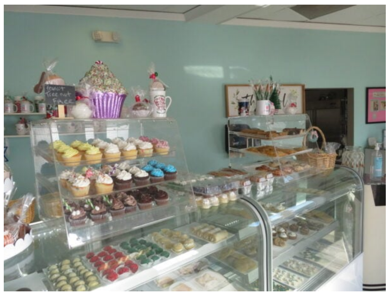
Main Street Pastries and More recently moved from Northborough to Chauncy Plaza at Turnpike Road in Westborough.

"It was the Monday before Thanksgiving," she said. "We moved nothing but big-ticket items. We brought the cases, and then the boxes and chocolates. We worked all night. We took our first shipment on Tuesday, and we've been baking ever since."